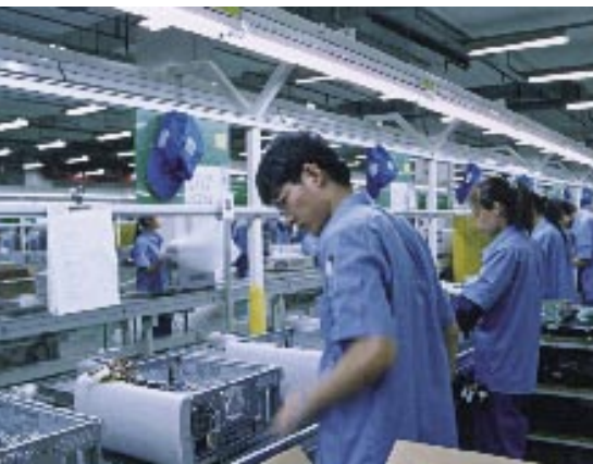
LENOVO BEIJING DESKTOP ASSEMBLY LINE

To respect intellectual property rights of other companies and individuals, all Lenovo people are required to obtain necessary license or other permission in order to use non-Lenovo proprietary materials such as copyrights, patents or trademarks. Lenovo corporate policies also ensure protection of privacy, workforce diversity and nondiscrimination, and controls against conflicts of interest.