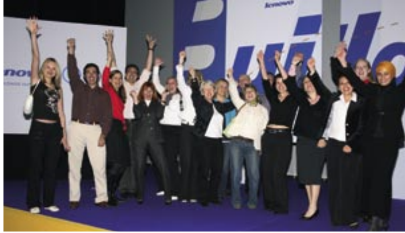
THE LENOVO EMEA UNIVERSITY, APRIL 06

Lenovo people worldwide rally around four key values: Serving customers, Innovative & entrepreneurial spirit, Accuracy & truth-seeking and Trustworthiness & integrity. These four pillars provide the underpinning for the company's future and a firm foundation for all Lenovo stakeholders.