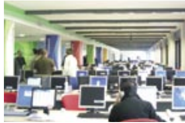
TORINO OLYMPIC COMMITTEE CONTROL CENTER