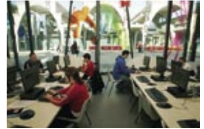
LENOVO OLYMPIC VILLAGE I-LOUNGE IN TORINO