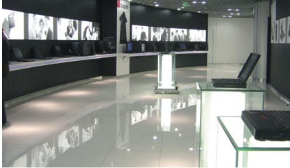
INNOVATION CENTER BEIJING, CHINA

Industry benchmark With 46 quality testing labs spread worldwide, Lenovo leads the industry. The first PC manufacturing company to win ISO 9001 quality certification, Lenovo purchases components only from the most reliable Tier 1 suppliers.